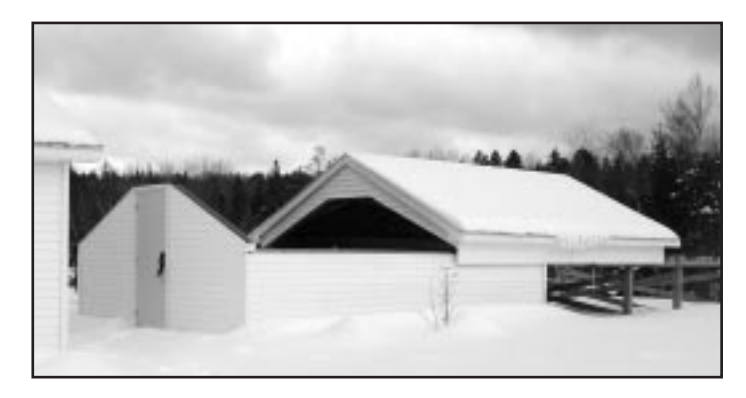
The St.Croix observatory. Pictured from left to right, the RASCan, the warm room and the roll-off roof observatory.