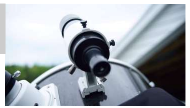
The 8x50 inverted-image optical finder with crosshairs on the Sky-Watcher Dobsonian telescope.

I need to say a few words about data entry: be mindful of the US mm/dd/yyyy date format; enter your STANDARD time zone (Daylight Saving Time is handled independently); use NEGATIVE hours for time zones west of Greenwich.