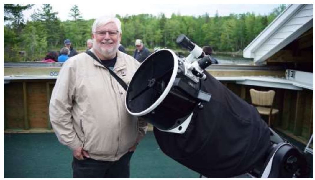
The author at RASC Halifax's Saint Croix Observatory with the 400 mm Sky-Watcher SynScan altazimuth Dobsonian telescope.

Before initializing the telescope and beginning to observe, there are several things you should take care of, perhaps in daytime: make sure your battery is charged (if rechargeable) or sufficiently fresh (if not). Have backup power handy. Make an observing plan (even in your head) and go through the checklist of all the things you need to take to the observing site. Review the initialization and alignment procedures and pick out some bright alignment stars appropriate to the season (the aforementioned online manual has a page appended with named navigational stars—they are good).