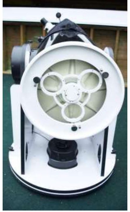
Collimation knobs at the base of the Sky-Watcher SynScan altazimuth Dobsonian telescope.

Tips on Setting Up a Sky-Watcher SynScan Dobsonian Telescope continued Dave Chapman (dave.chapman@ns.sympatico.ca)