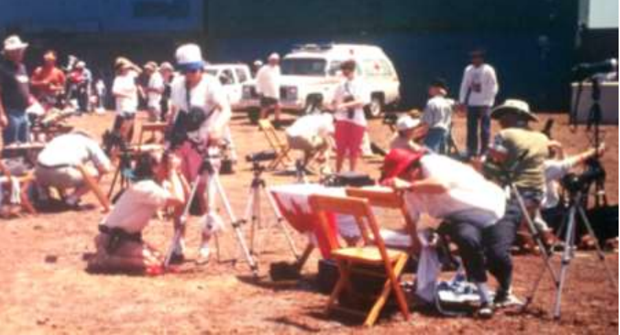
A crowd gathers to watch the 1998 Eclipse in Curacao. About a dozen members of RASC Halifax joined the trip organized by the Calgary Centre.

gaze at that celestial apparition for another half minute, taking particular note of any fire-engine-red flaming prominences extending beyond the lunar limb, and study the delicate, ghostly structures in the pure white, million-degree, hot solar corona. Can you see albedo features on the new Moon, now illuminated by maximum earthshine? Back to the eyeball mode for another sweep of the horizon, and a brief check to see if Mercury, Venus and possibly a few bright stars are visible. Fifteen seconds before totality ends, raise your binoculars again and watch for the formation of Bailey's Beads as the Moon drifts eastward and the solar photosphere begins to shine through valleys on the Moon. A second or two later a spectacular diamond ring will form, surrounding the Moon, growing rapidly in brilliance, warning you to look away. Immediately