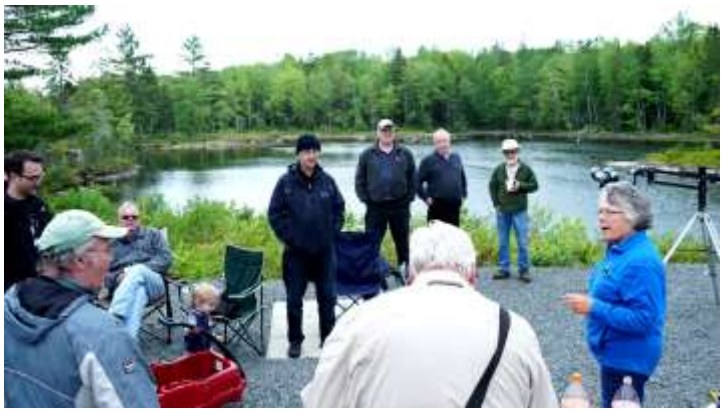
Good friends, good food and a fantastic setting make for a great June meeting.

It was great to see new as well as long-time RASC members in attendance, despite the cool temperatures. Carpooling, as recommended in the notices, worked well in reducing the number of vehicles parked at SCO.