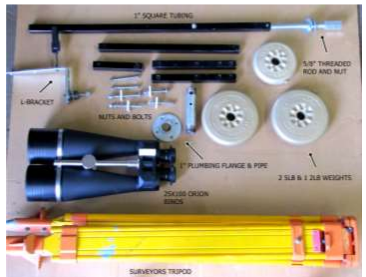
Parallel Mount Components.

work. I found 12 lbs. worked nicely. I made a hook affair out of a piece of threaded rod to suspend the weights from the long arm of my parallelogram mount. This 'final' job done, I packed up and headed to Keji for their launching of Boxing Rock's "Dark as Keji Beer".