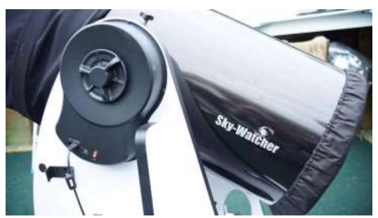
The hand clutches on the side and base are loosened when pushing the scope by hand and tightened when using the hand control to reposition the telescope.

Alignment), you also need to know the direction of true north. Use a magnetic compass, correcting for the magnetic declination of your location (roughly 17° W in Nova Scotia), or a smart phone app.