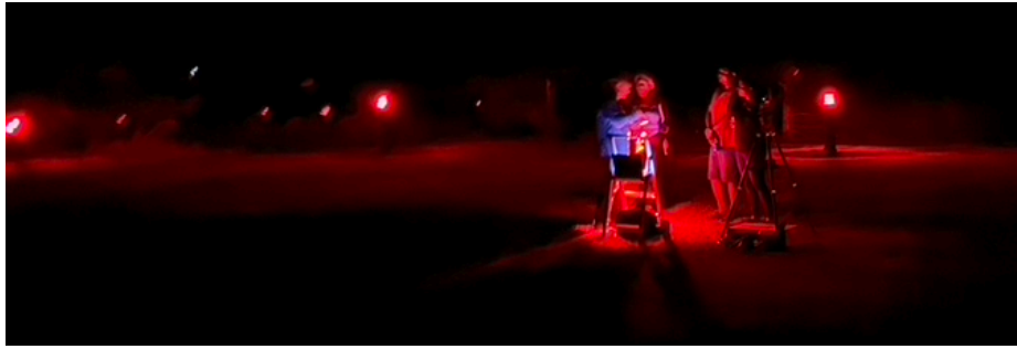
An astroimaging setup at demonstration on Sunday evening